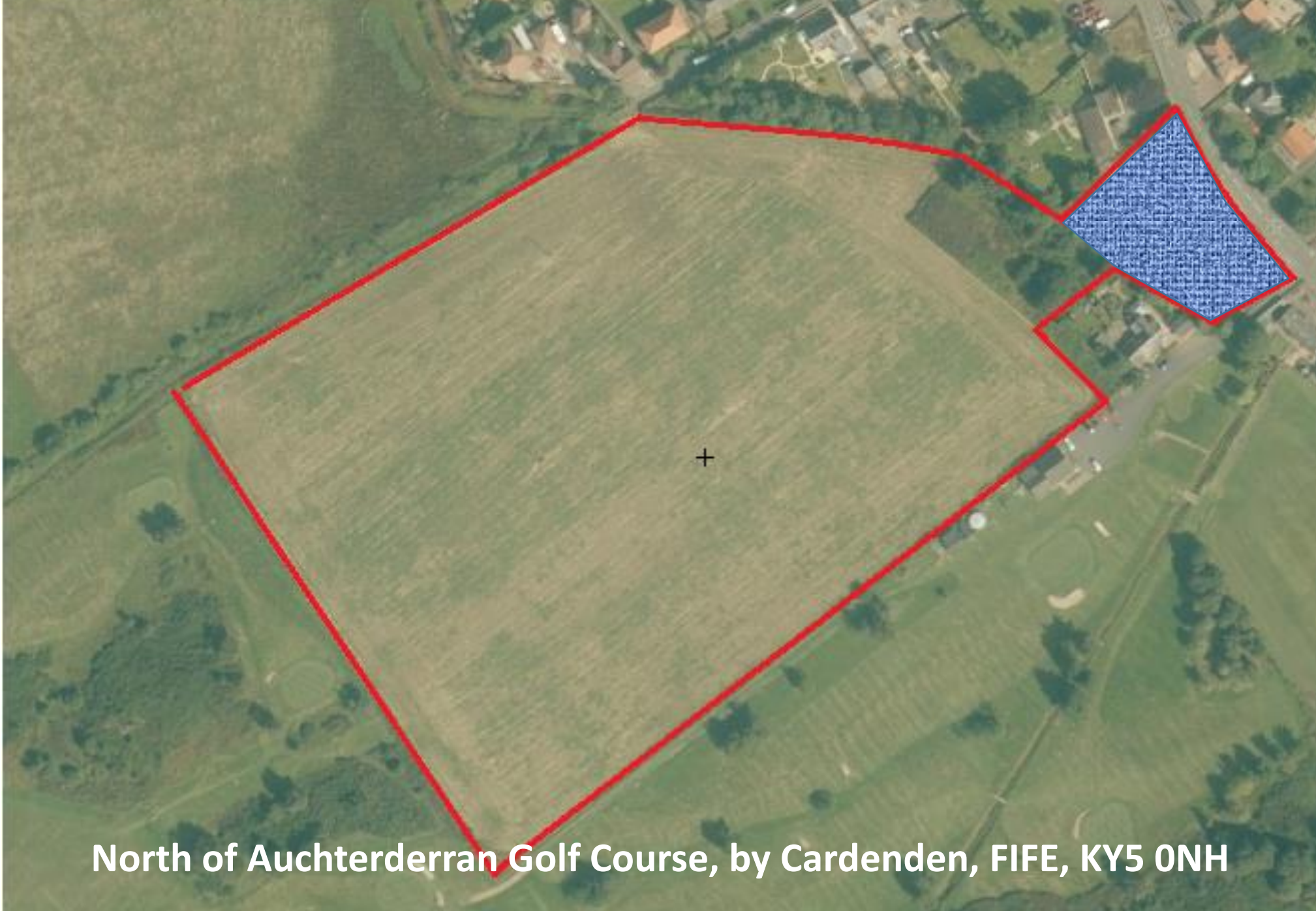
North of Auchterderran Golf Course, by Cardenden, FIFE, KY5 0NH