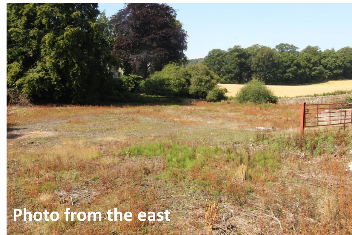
Photo from the east