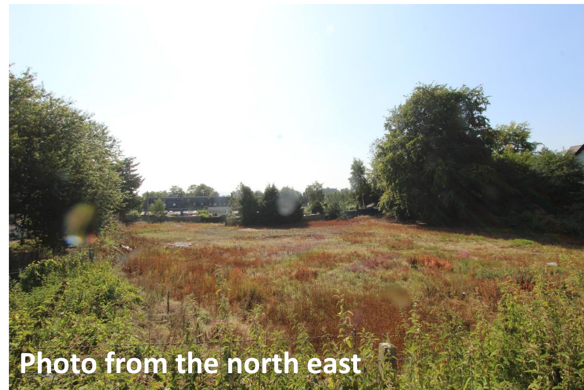
Photo from the north east