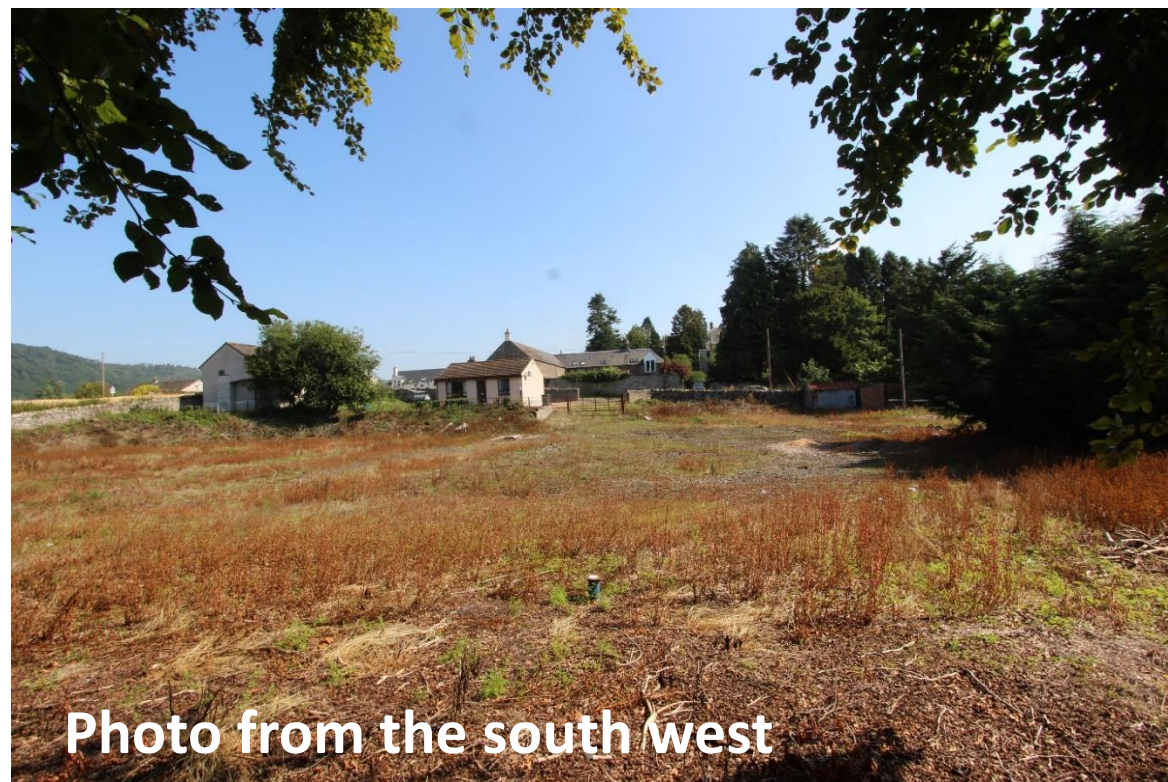
Photo from the south west