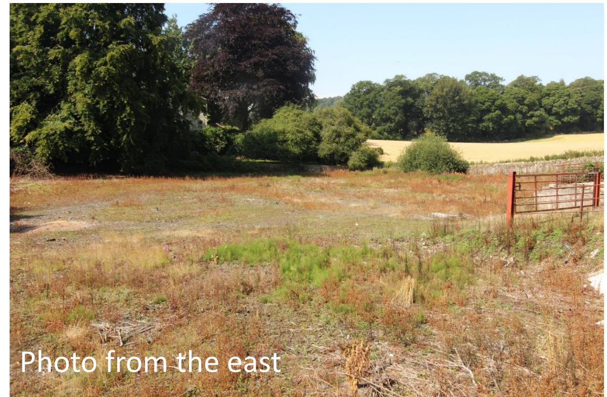
Photo from the east