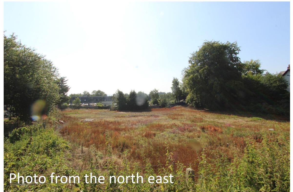
Photo from the north east