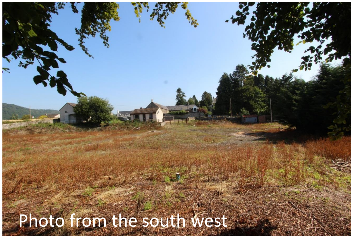
Photo from the south west