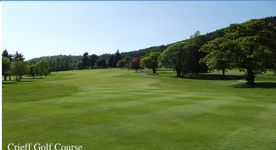
Crieff Golf Course