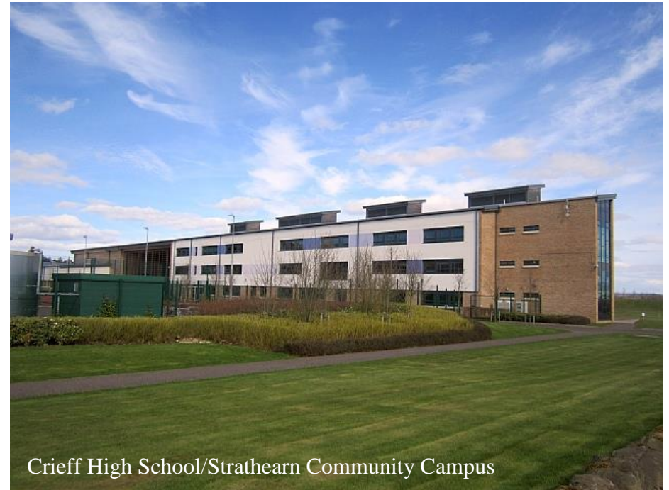
Crieff High School/Strathearn Community Campus

Offers must be submitted in Scottish legal terms to the Selling Agents, McCrae & McCrae Ltd at 12 Abbey Park Place, Dunfermline, Fife, KY12 7PD. A closing date for offers may be fixed and prospective purchasers are advised to register their interest with the Selling Agents.