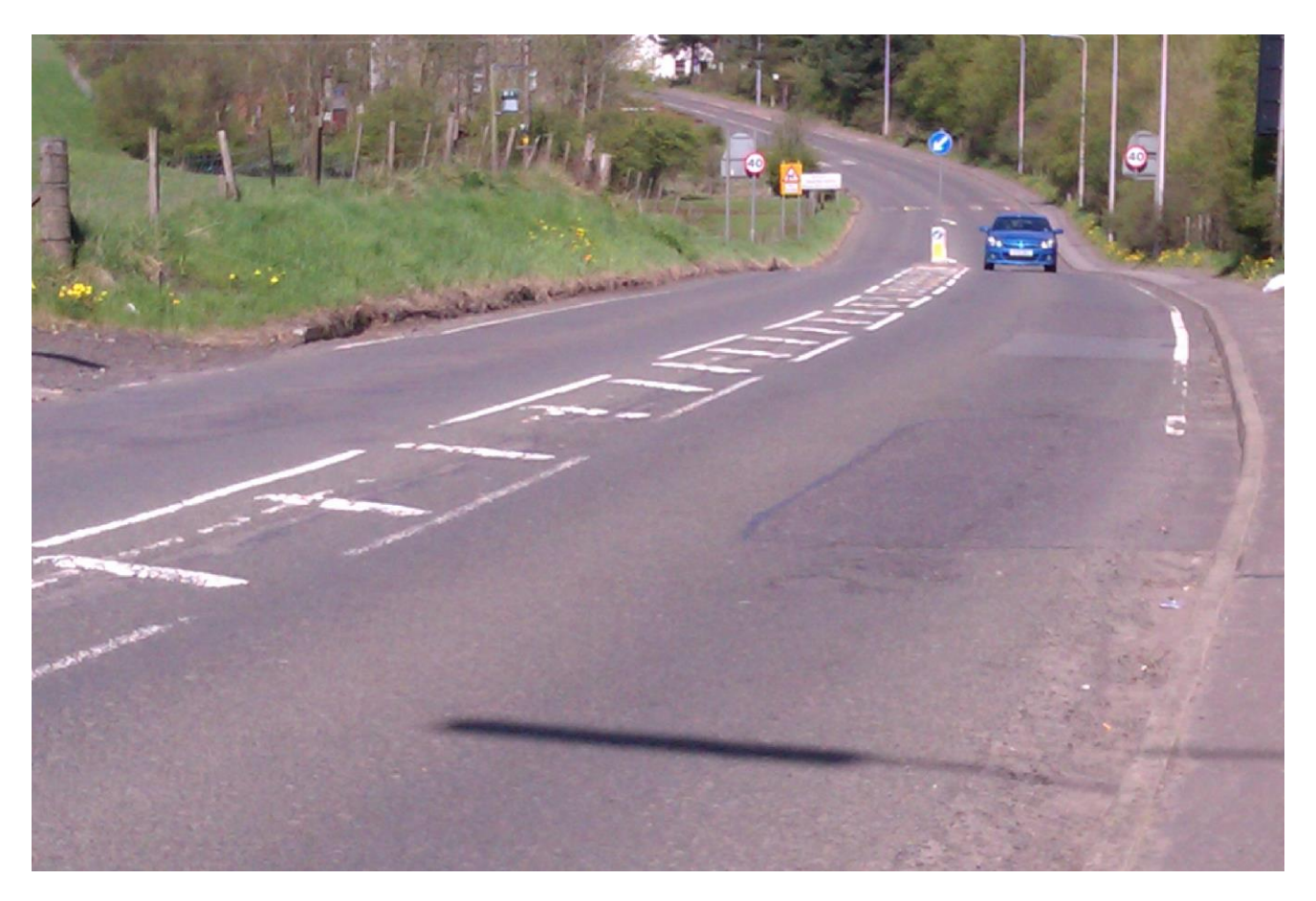
Views to north of Lot 2 access