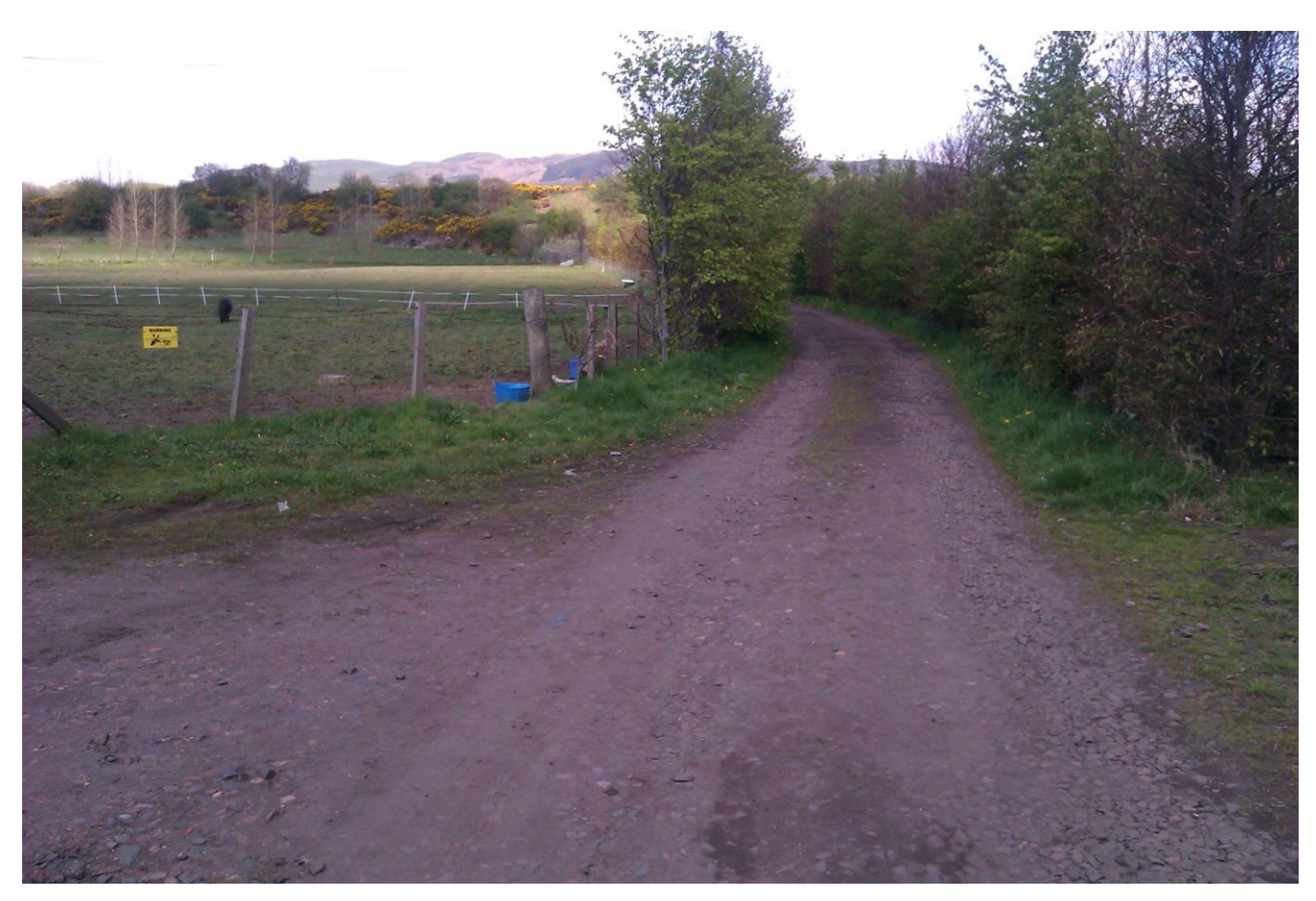
Access road to walks north of Lot 1