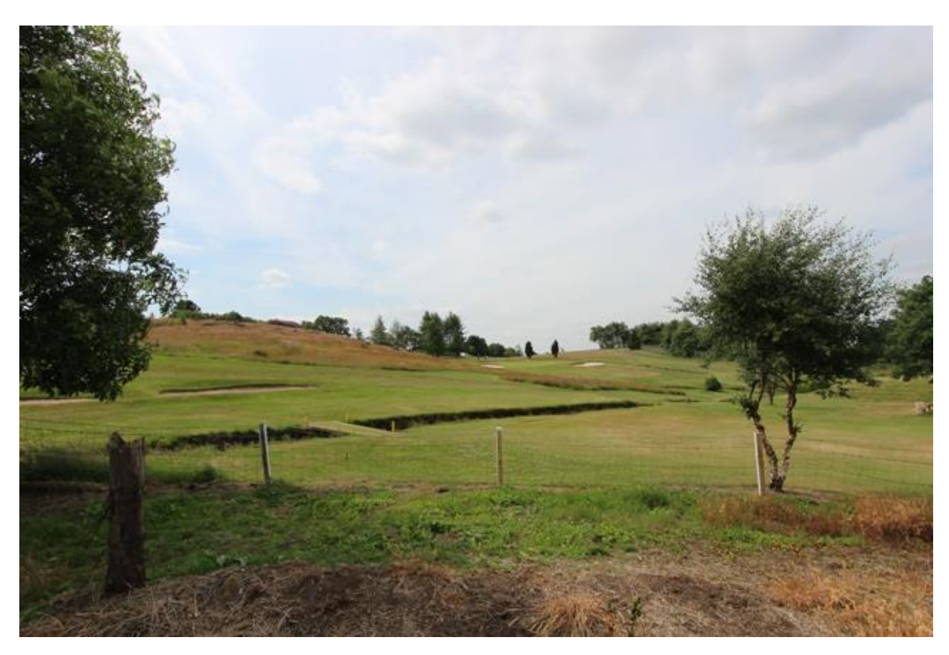
View to golf course from Lot 1