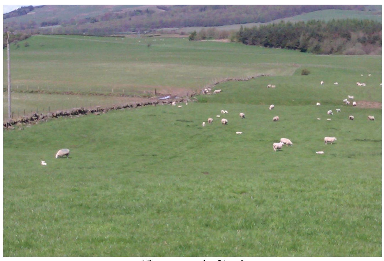
Views to north of Lot 2