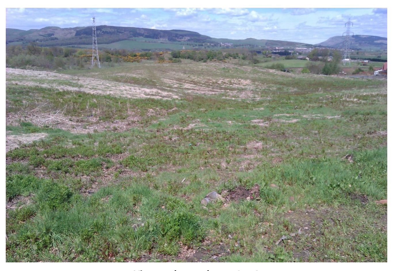
View to the north over Lot 1