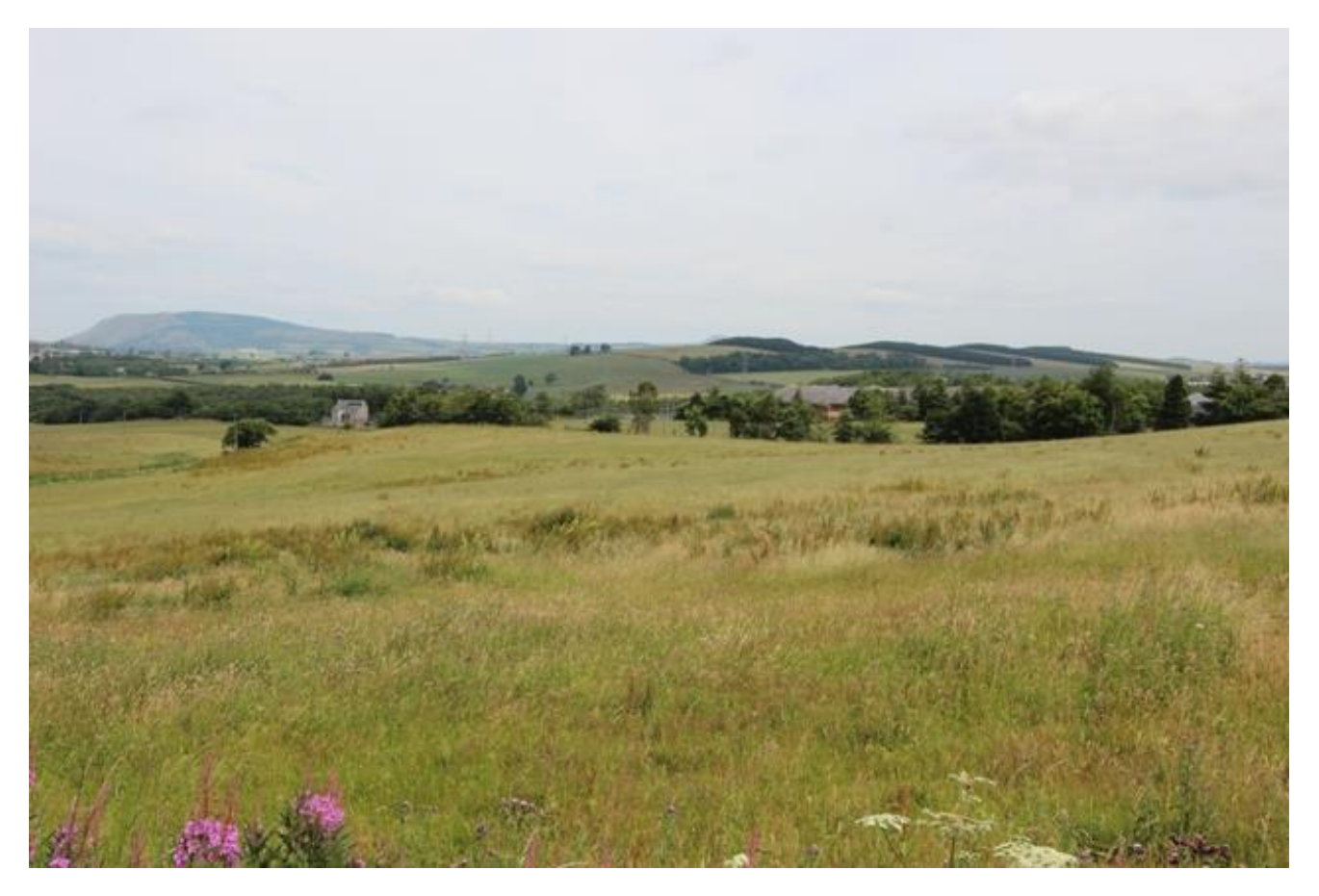
View from east of Plot 2 looking northwards