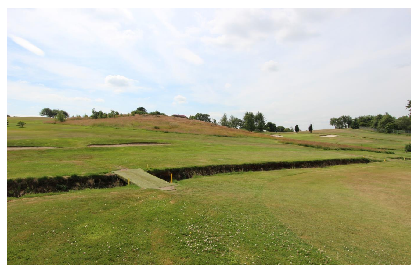
View to golf course from Lot 1