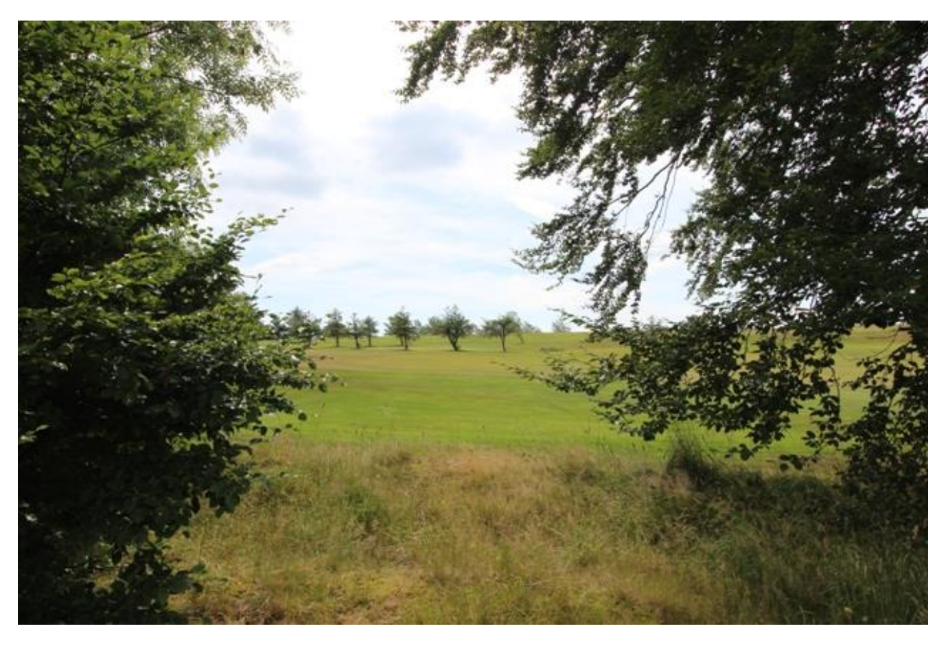
Views to Golf Course from west of Lot 1