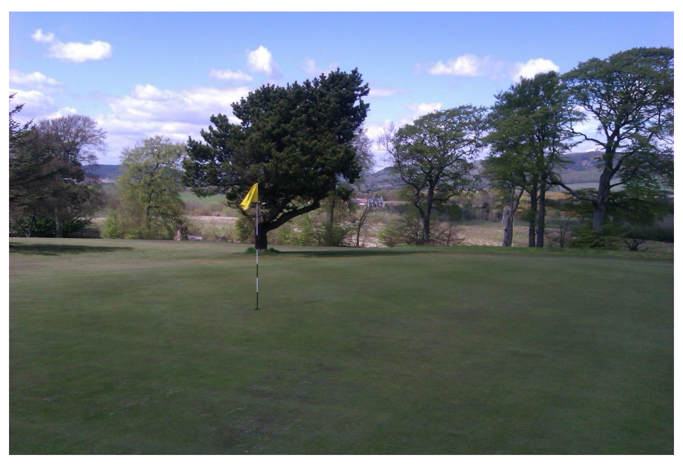
Views to Lot 1 over golf course