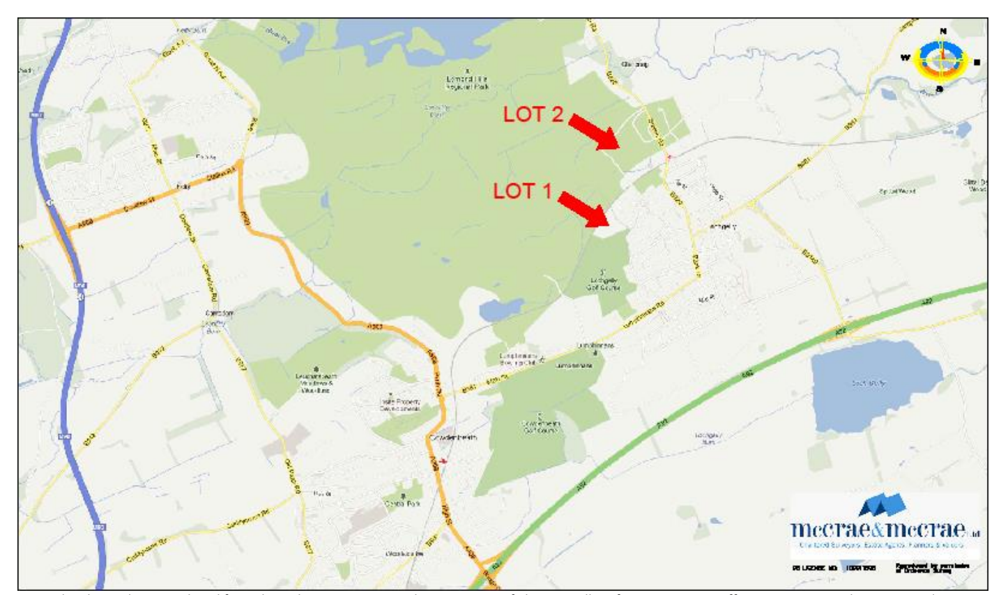
The above plan is produced from the ordnance survey map by permission of The Controller of H M Stationery Office. Crown Copyright. Not to Scale.

To Lot 2: From the A90 proceed as above until towards Lochgelly. Turn right onto the B920 and continue on this down past the railway station past Lochgelly High School and turn left just after the High School into the site. The road access is in from the east. The sellers have secured adequate access.