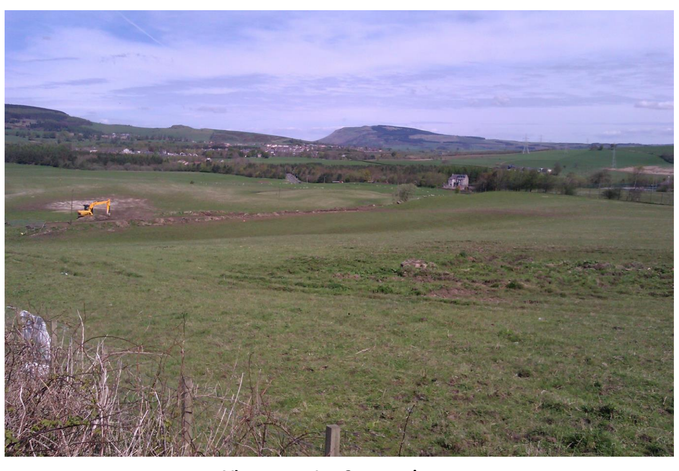
Views over Lot 2 to northeast