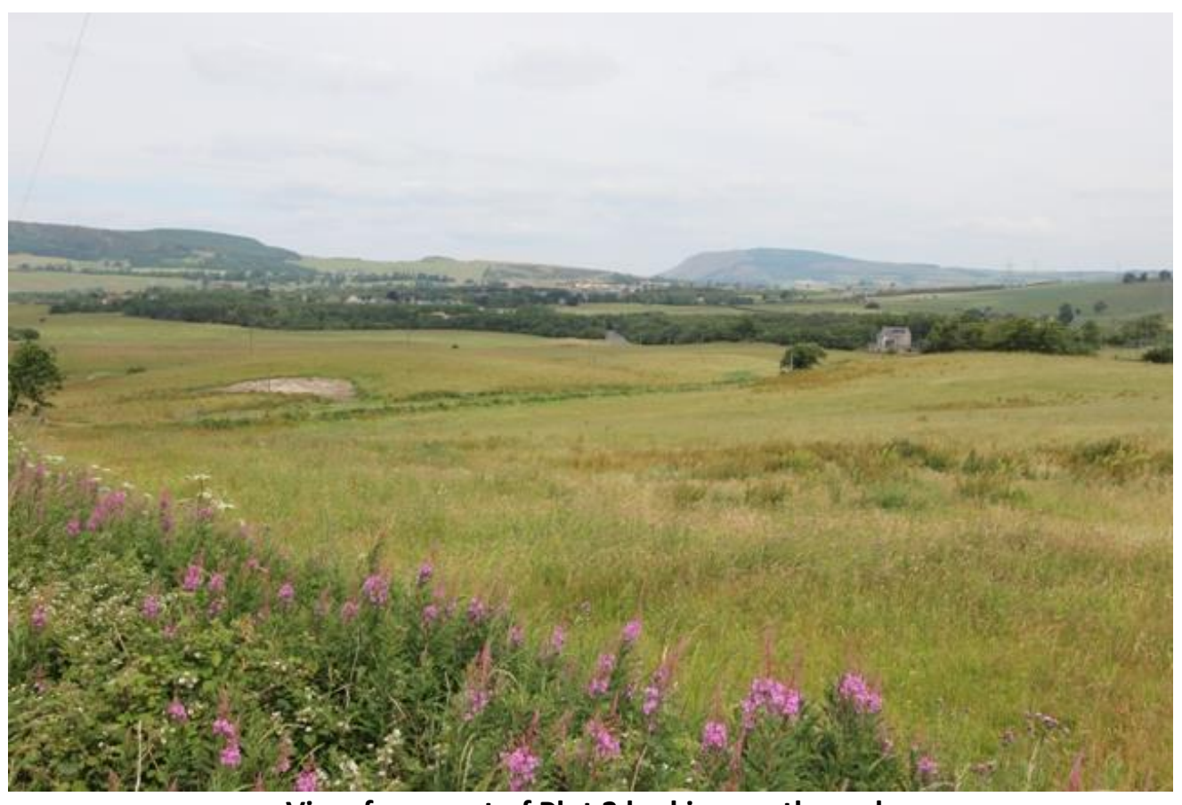
View from east of Plot 2 looking northwards