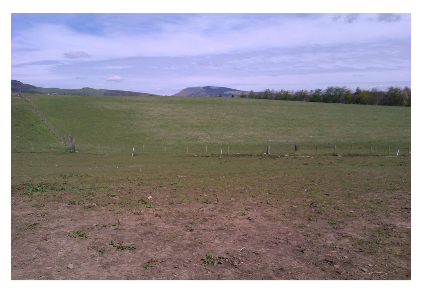
Views over Lot 2 from southeast