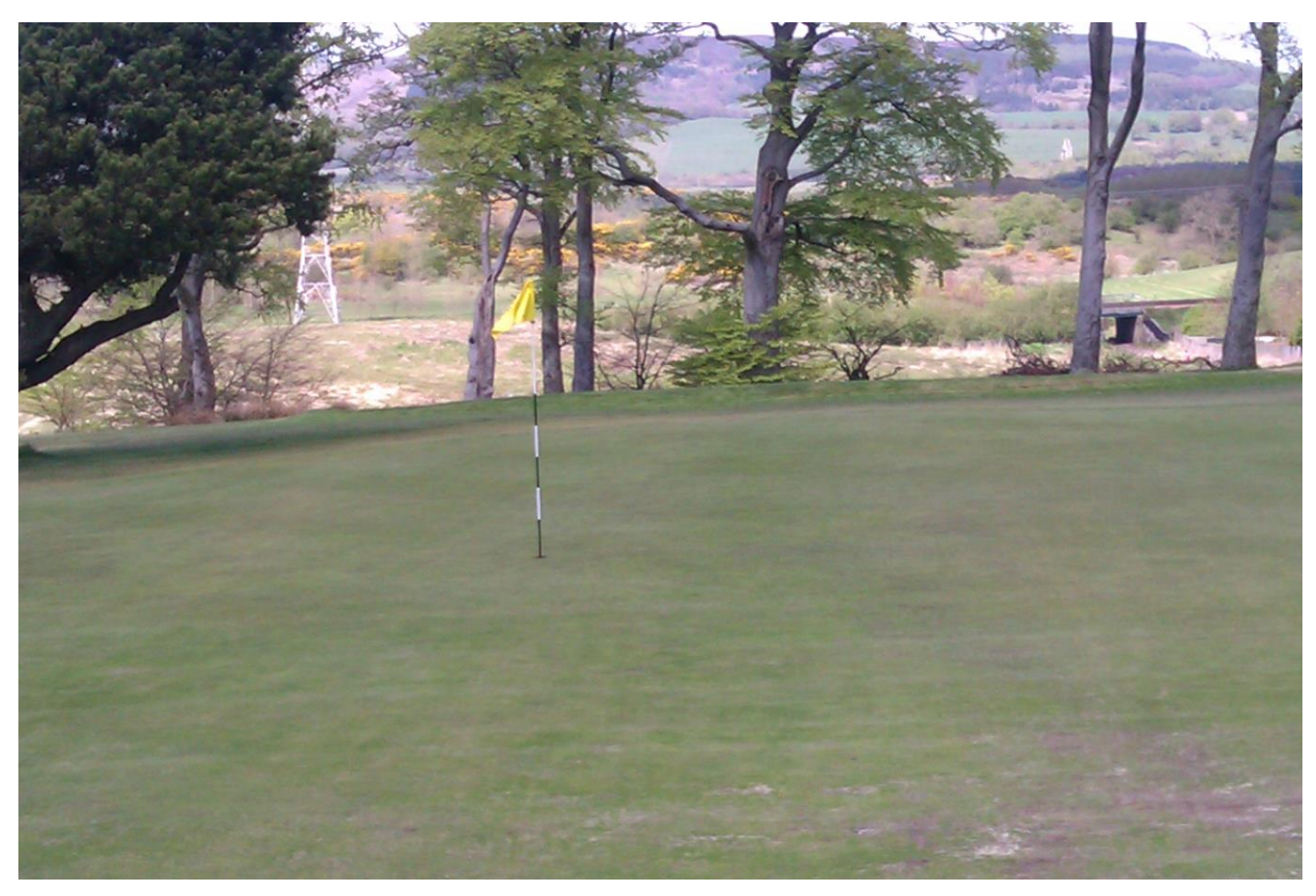
View to Lot 1 over golf course 1