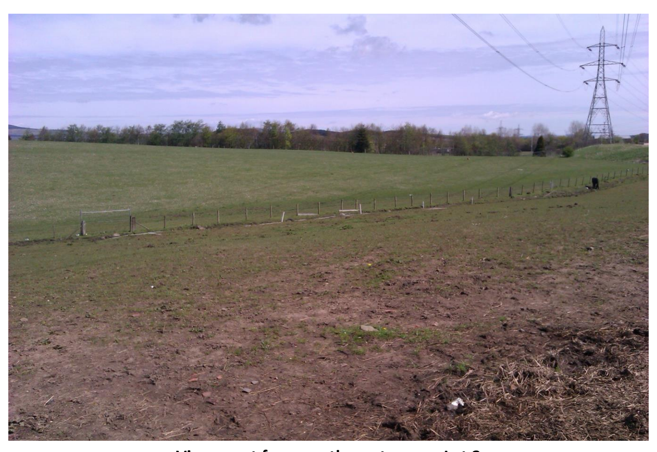
Views east from south west corner Lot 2