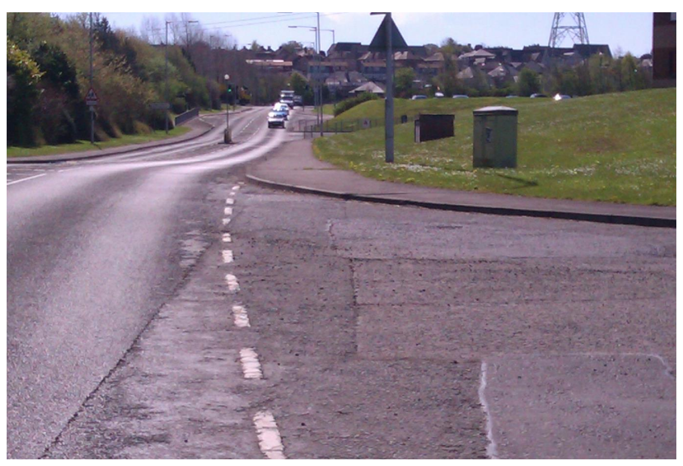
Views to south of Lot 2 access