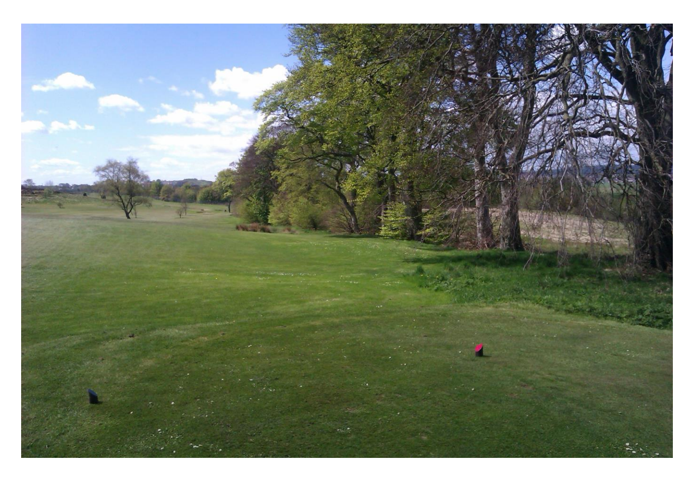
Views along south boundary of Lot 1