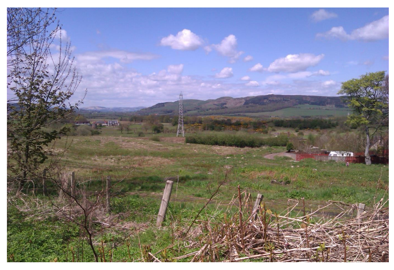
Views over Lot 1 from southeast